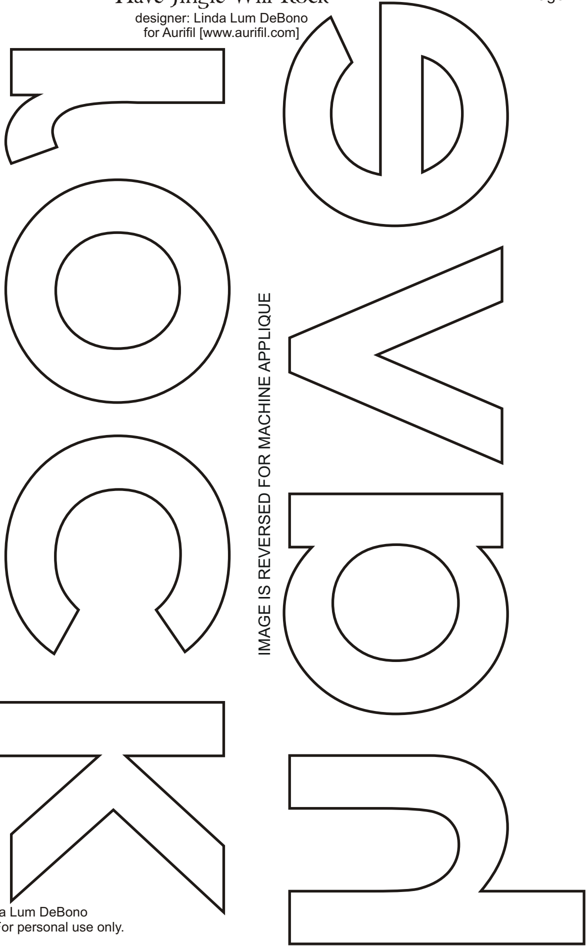
IMAGE IS REVERSED FOR MACHINE APPLIQUE